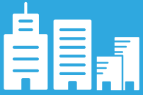
Cities & Public Venues